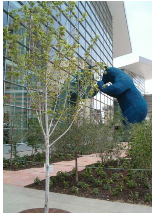
"I See What You Mean"