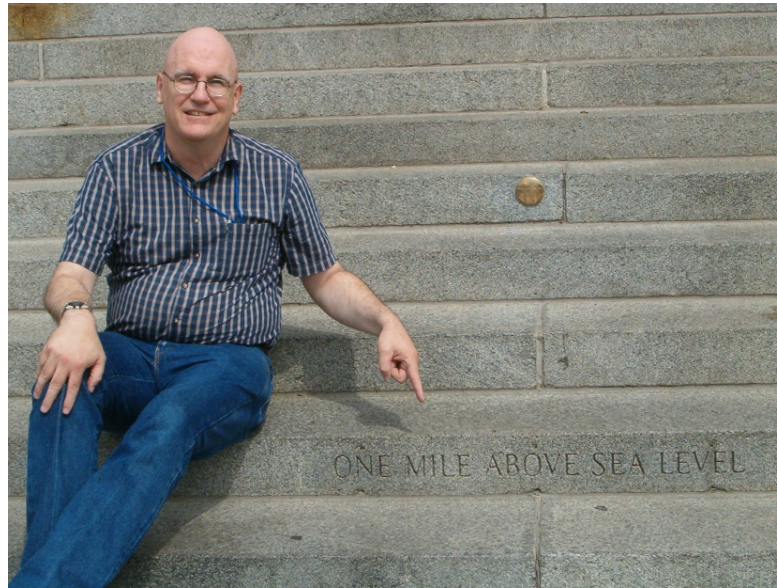
on the steps of the Colorado State Capitol building

So instead, there we were in Denver for Denvention 3, not all that sure we'd be having a good time. I'd been there once before, back in 1995, but the closest Nicki had ever been to the city was when we changed planes at the Denver airport on the way home from the 2002 worldcon.