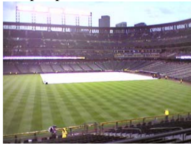
rainy Coors Field

Luck didn't always work in our favor, though. We had pre-purchased two tickets to the August 5 th baseball