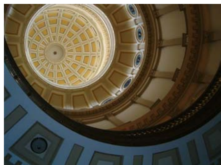
the Colorado Capitol rotunda

the most popular aquatic creatures, as least as far as the viewers were concerned – two scuba divers. The aquarium is making a bit of money by selling "tank time" for people who want to swim among the fishes. Not something for the faint of heart to do, as there were sharks in there.